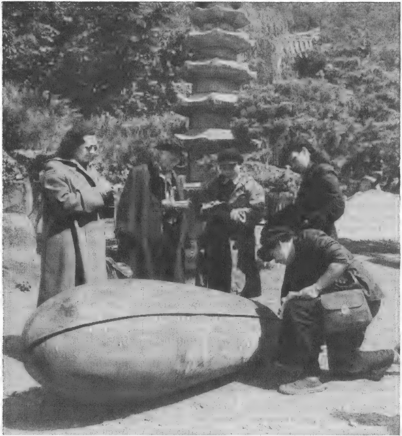
Phyöngyang At the ruined temple of Mo-Ran

which, when it reaches the ground or comes into contact with a building, opens without exploding. In opening, it throws out a mass of some substance which sticks to brick, wood or any other materials with which it happens to come into contact and which, as soon as it is struck by sunlight bursts into flames and will then set a whole building on fire.